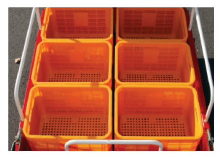
Generous size that can load 6 boxes of 20kg (based on 600tld)