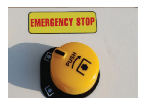
Emergency stop switch that can safely turn off the engine in emergency situations