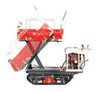
Dump and lift conversion with simple lever operation