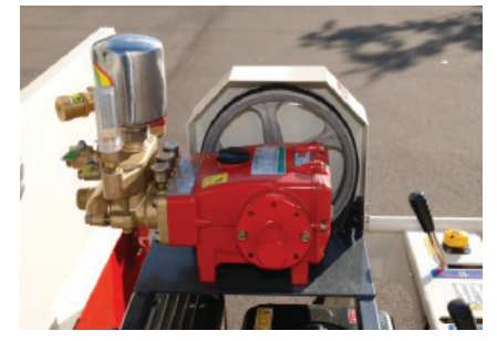
Atomizer can be installed *Atomizer die can be purchased separately